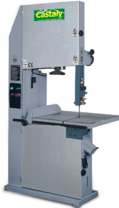
BS-0202 / BS-0242

BS-0181 18" Wood Band Saw BS-0202 20" Wood Band Saw BS-0242 24" Wood Band Saw