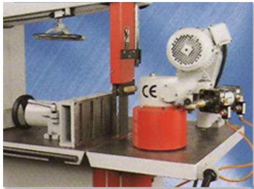
Optional Power Feeder