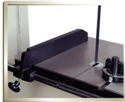
CAST IRON FENCE