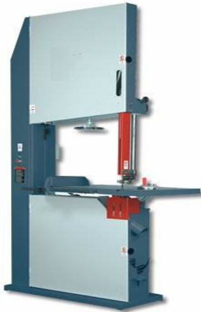
BS-800 32" Wood Band Saw BS-950 36" Wood Band Saw