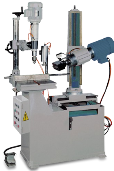
BR-25+1 2 SIDE Universal Boring Machine BR-50+1 2 SIDE Universal Boring Machine

Optional Accessories: Multiple Drill Head.