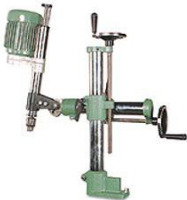
BR-101 UNIVERSAL BORING HEAD