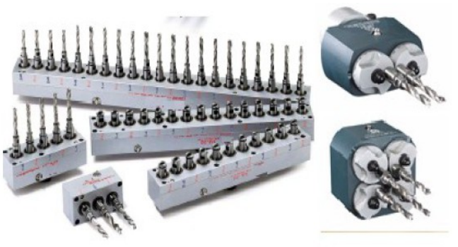
Optional Drill Spindle & Multiple Drill Heads