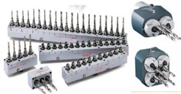
Optional Drill Spindle & Multiple Drill Heads