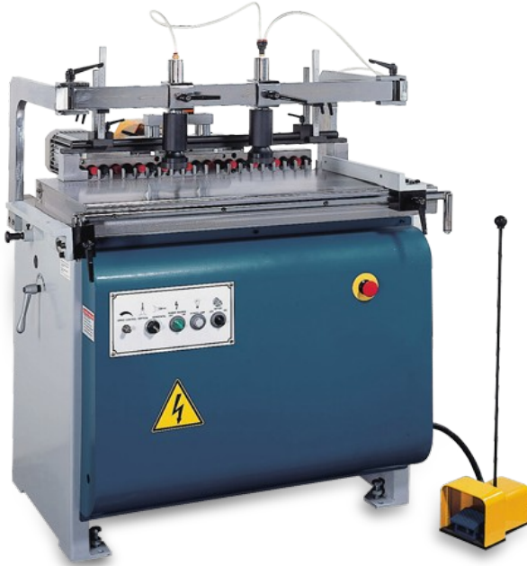
BR-2132 21 Bits Universal Boring Machine