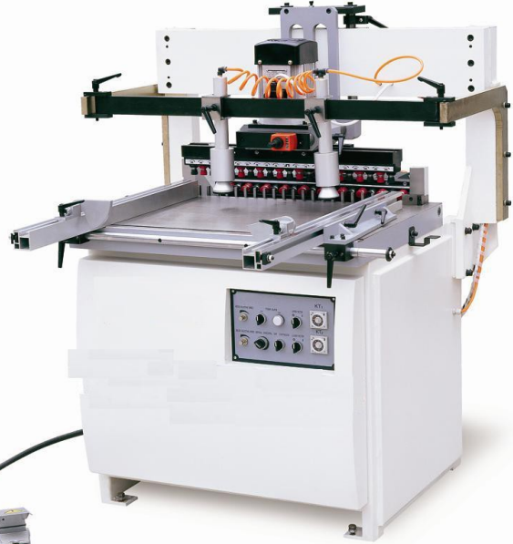
BR-4232 21 Bits x 2 One Top One Universal Boring Machine