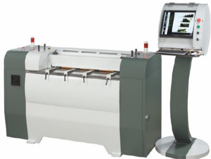
CNC Dovetail Machine