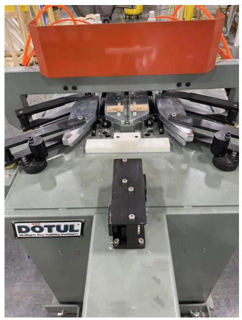
Infeed End View