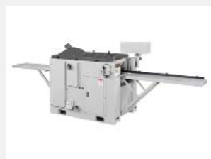
Rear view of M412