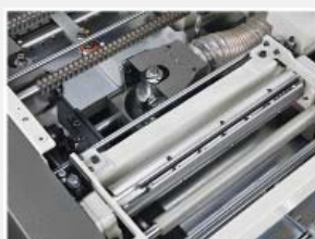
Under the hood