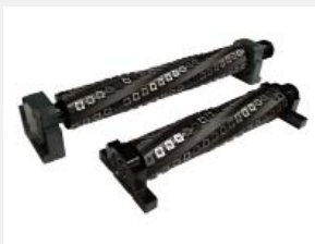
Optional top and bottom spiral cutterheads