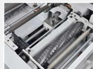
M412 with optional top and bottom spiral cutterheads installed