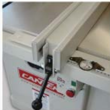
T-square 50" rip fence

The Cantek TA Series Table Saws are for serious woodworkers and production shops that require an industrial strength and powerful table saw. The large precision-ground & polished cast-iron table and cast-iron saw unit ensure vibration free cutting with optimum cut quality. The quick setting T-square rip fence is equipped with dual inch & metric scales for precise rip cutting. The blade guard is mounted to a splitter with anti-kickback pawls for safe operation. Comes standard with both standard and dado arbors and table inserts. Driven by a powerful motor to make the cuts you need effortlessly.