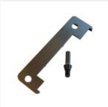
Dado arbor and insert