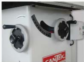
Blade height and tilt adjustment handwheels