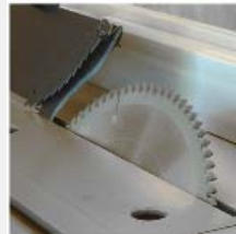
Right tilt to 45°