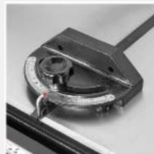
Miter gauge with T-miter slot on both sides of the table