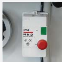
CSA / UL approved magnetic switch