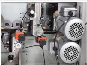
PVC scraping unit with 2mm radius knives and buffing motors