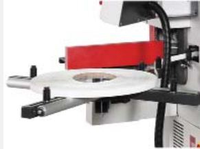
Coil edge feeding tray