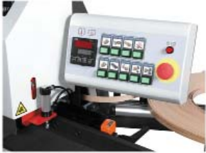
Operator control located at infeed of machine, heated infeed fence

The Cantek MX350 Automatic Edgebander is a compact edgebander capable of applying up to 3mm thick edge tape on cabinet parts and more. The counter rotating pre-milling cutters ensure optimum panel edge quality and squareness which result in a less visible glue joint. It comes equipped with high frequency motors on both the end trim and top & bottom trim. In addition it is equipped with PVC radius scraping and buffing units. User friendly controls and adjustments allow for efficient changeovers of edge tape thicknesses between 0.4mm & 3mm. It's compact design and affordable price point make it the ideal edge banding solution for the small cabinet shop who requires pre-milling.