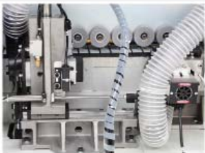
High frequency end trim for front and rear trimming of panel