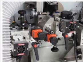
High frequency top & bottom trimmers with mechanical readouts