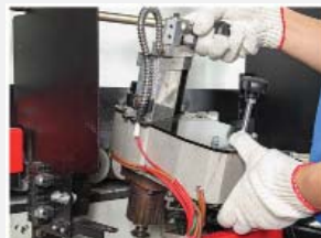
Quick change glue pot