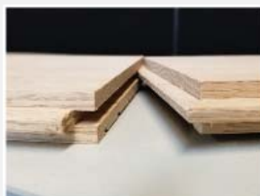
Sample: Tongue and groove flooring