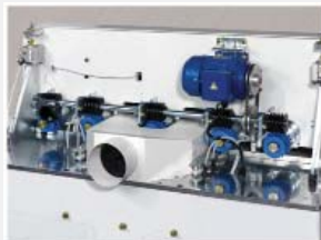
Feed system (with hood removed) and dust hood