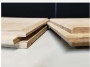
Sample: Tongue and groove with bevel flooring or paneling