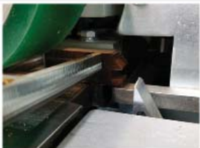
Anti-tear out blocks