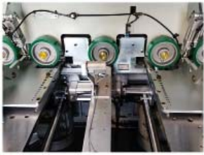
Feed system, infeed, outfeed, and clamps

The Cantek EM12 End Matcher is specially designed for machining tongue and groove (with or without bevels) on hardwood flooring and wall/ceiling paneling up to 12" wide. Its compact design with continuous through feed system allows for maximum output in a small space. Equipped with a user-friendly touch screen interface allow for simple operation with excellent performance and error diagnostics. The dual counter-rotating cutterheads produce both the tongue and groove simultaneously ensuring a perfect match. The anti-tear-out blocks and counter rotation of the heads ensure optimum cut quality without chipping or blowout. The insert style segmented cutterheads can be adjusted according to your desired tongue / groove thickness and can perform a micro-bevel or not. For added productivity the EM12 End Matcher can be installed in-line with our CFS100 Automatic Defect Cutoff Chop Saw to perform defecting and end matching in a single line.