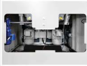
Powerful 10HP cutterhead motors