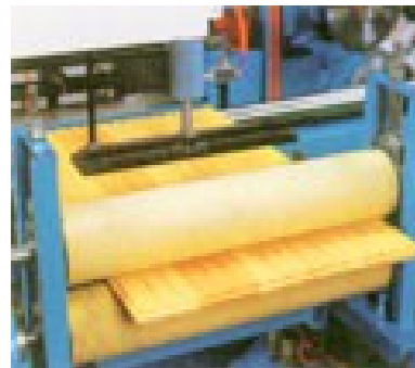
SET-52SAT Shaper Head