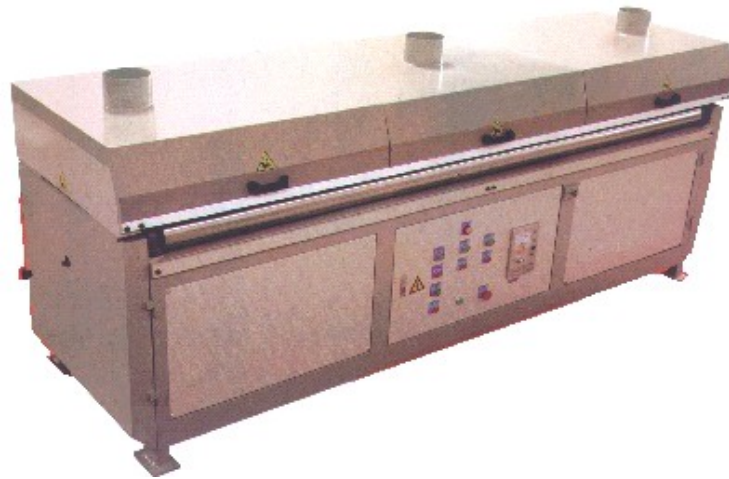
TRS-1300 to TRS-2600G Transfer Line