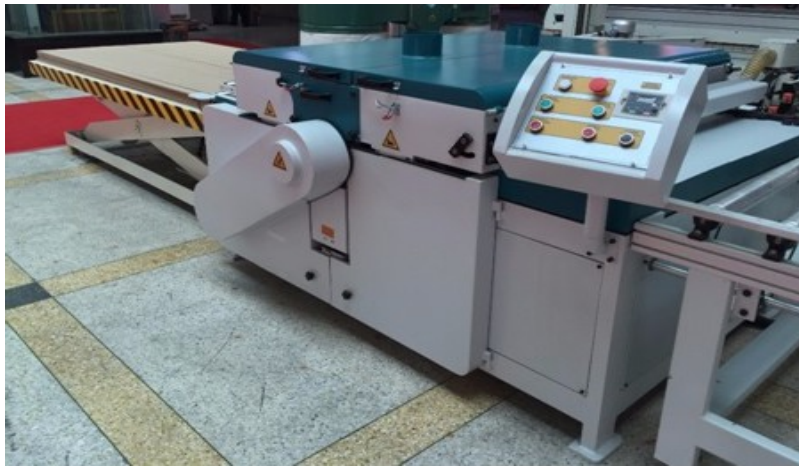
TRS-1300 to TRS-2600G Transfer Line