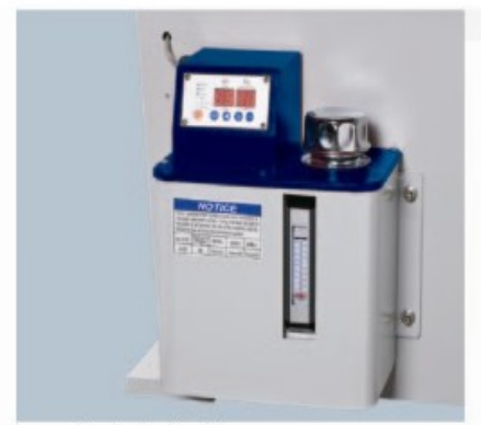
Automatic Lubrication The auto lubrication device is equipped with an alarm light and send signals upon a lack of lubrical oil to increase the durability of the machine.