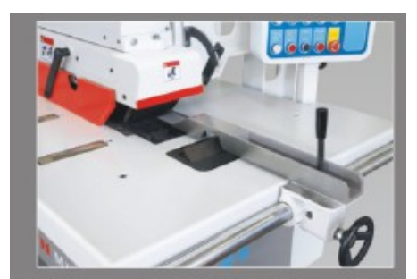
Backup plate positioning device helps to adjust the width of saw cutting. The iron backup plate slides on the well-processed round bar smoothly and can be fixed easily and accurately, which further improves the trimming deflating effects.