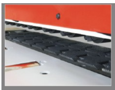
The double-brack feeding track could widen the work piece thus enables more accurate and smoother trimming deflashing.