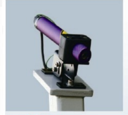
Laser Optional Available to be fitted with laser unit and can p review precision of the saw path in advance for long length of the woodworking pieces with less loss on the material.