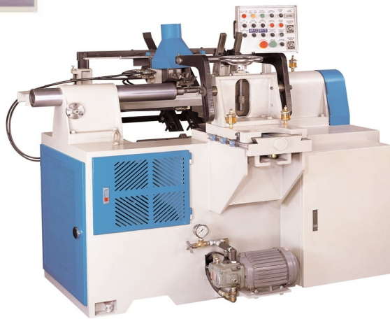
CL-113 Auto Turning Lathe