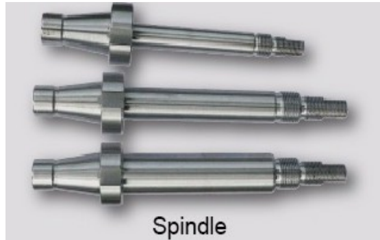
Standard 3/4" & 1", Optional 1-1/4" Spindle