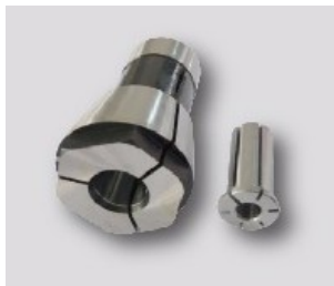
Optional 1/4" or 1/2" Collect