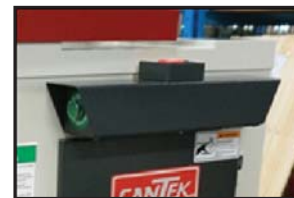
*PCS18 left-hand machine with foot pedal shown with optional infeed & outfeed roller conveyor