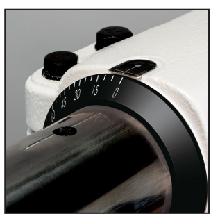
Inclinable Feeding Adjustment Indicator