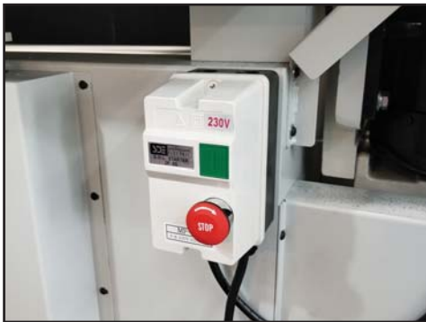
CSA MAGNETIC SWITCH