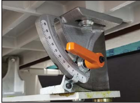
TILTING TABLE LOCKING MECHANISM WITH ANGLE INDICATOR