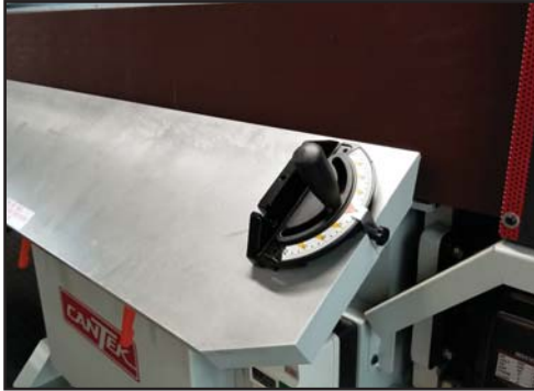
TILTING TABLE 0 - 45°