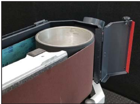
RUBBER COVERED DRIVE ROLL WITH FLIP OPEN GATE FOR SANDING LONGER PIECES