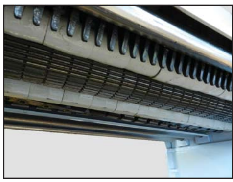
SECTIONAL FEED & SAFETY SYSTEM

Equipped with sectional kickback fingers, sectional spring loaded serrated pressure rollers, and sectional pressure shoes for the most positive and safe feeding operations. Also equipped with double non-marking smooth outfeed top pressure rollers.