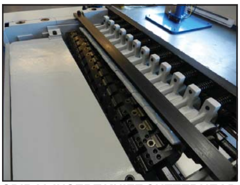
SPIRAL INSERT KNIFE CUTTERHEAD The spiral insert knife cutterhead provides a smooth finish with superior stock removal, and ultra quiet cutting operation. 2-sided solid carbide insert knives can be easily rotated for a new sharp cutting surface.