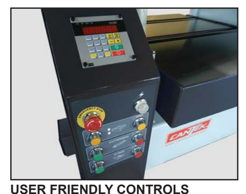
Equipped with digital thickness control with

dual INCH/Metric display. The digital control allows you to quickly and accurately adjust the table for precise thickness setting. Equipped with a variable speed drive for adjusting the feed speed to obtain the optimum feed rate.