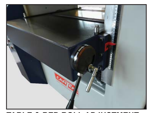
TABLE & BED ROLL ADJUSTMENT The idle bed rolls are conveniently adjusted from the front of the table. The eccentric cam allows you to raise and lower the bed rollers and can be locked in place for optimum feeding results on both rough and smooth material.

Equipped with adjustable idle bed rollers which can be raised and lowered to facilitate in feeding difficult material. The rollers are directly opposed from the top driven feed rollers. The table surface is ground and polished to provide minimal friction.