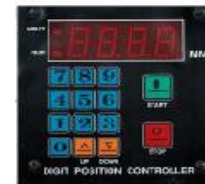
DIGITAL THICKNESS SET UP

WS-DA1100 43" X 86" 2 Heads Wide Belt Sander