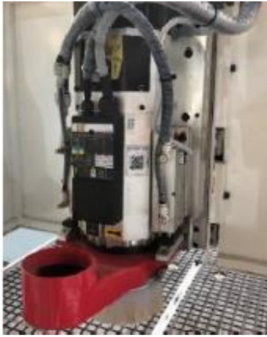
9.0 kW spindle