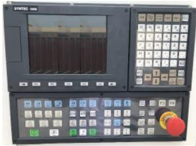
Syntec 6MB control