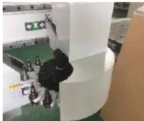
12 tools linear ATC