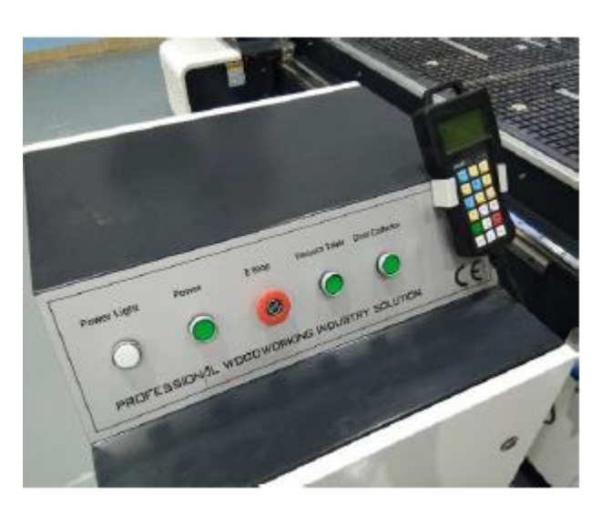
Rich-auto NK105 control