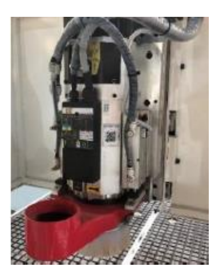
9.0 kW spindle