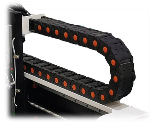
Gore track cable protection