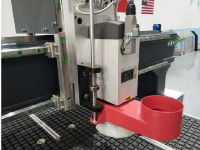
34.5 kW spindle