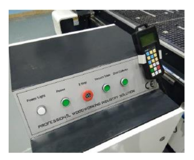
Weihong NK105 control