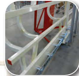
New Frame Design