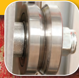
Dual V-track & Bearing