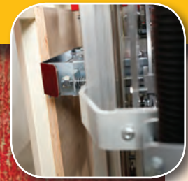
Material Pressure System

“Our Safety Speed Panel Saws are the most reliable, essential and flexible tools we have.”