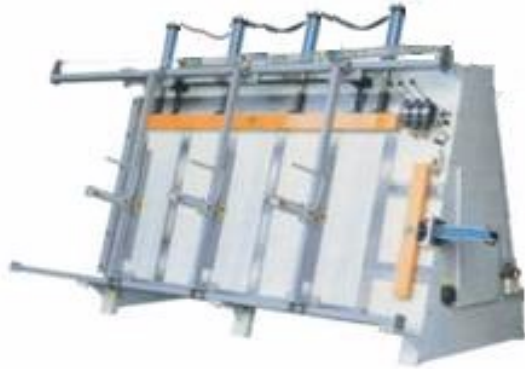
PT-48VA-1 (1 Side)