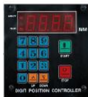
DIGITAL THICKNESS SET UP