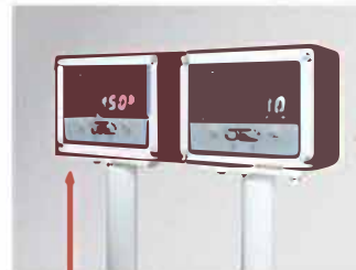
SPINDLE TILTING LED DIGITAL READOUT (Optional)