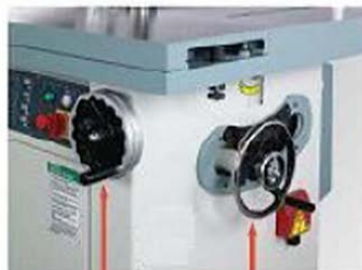
SPINDLE TILT HANDWHEEL