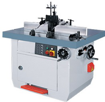
Optional : Tilting Spindle