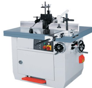
Tilting Spindle & Sliding Table