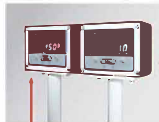
SPINDLE TILTING LED DIGITAL READOUT (Optional)