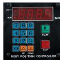
DIGITAL THICKNESS SET UP