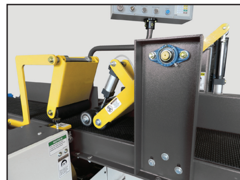
Powerful Hydraulic Feed System All electrical controls of the machine are on one control panel for convenience.