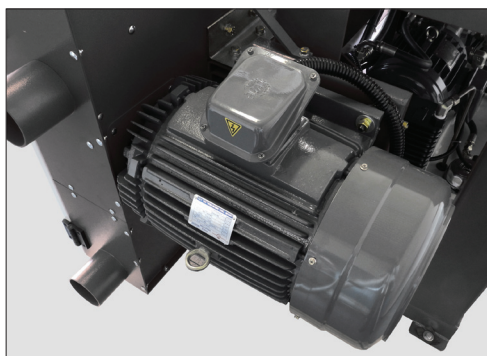
Powerful 20HP Saw Wheel Motor The hydraulic system consists of high quality hydraulic parts, featuring long service life and low heat generation.