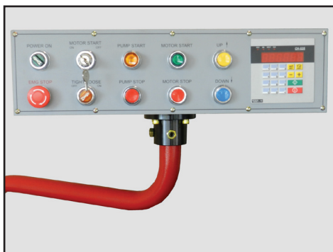
Digital Thickness Control Manual elevation of saw wheels is transmitted through a worm gear mechanism for easy operation.