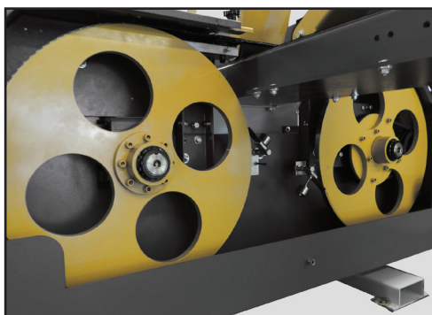
Heavy Duty Steel Saw Wheels Is driven by motor, providing fast and convenient adjustment for thickness of cut.