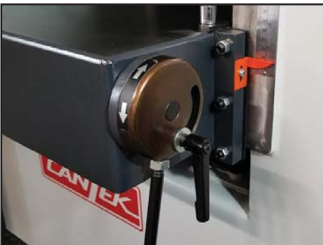
TABLE & BED ROLL ADJUSTMENT

Equipped with adjustable idle bed rollers which can be raised and lowered to facilitate in feeding difficult material. The rollers are directly opposed from the top driven feed rollers. The table surface is ground and polished to provide minimal friction.