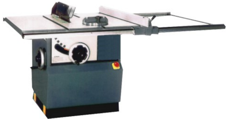
TS1414 / TS-1616

TS-1010 10" Universal Table Saw TS-1212 12" Universal Table Saw TS-1414 14" Universal Table Saw TS-1616 16" Universal Table Saw