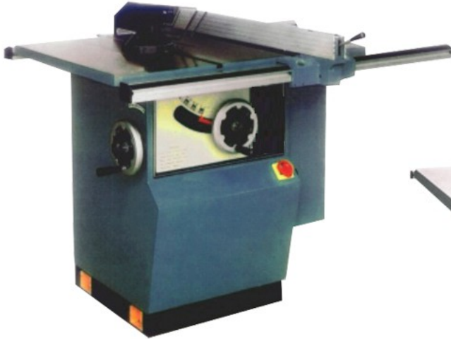
TS-1010 / TS-1212