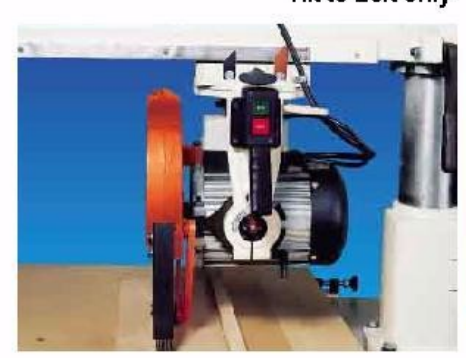
0 to 90 degree