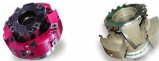
Helical plane cutter head with throw-away T.C.T. tip(option)

(Training and installation, tooling & rigging are optional) (Customer is responsible for local regulations and connecting utilities)