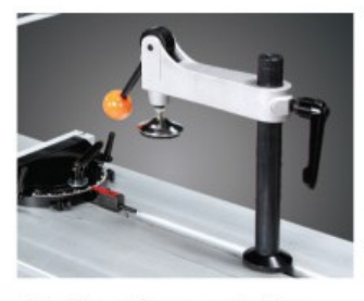
Quick and secure locking wood pressure