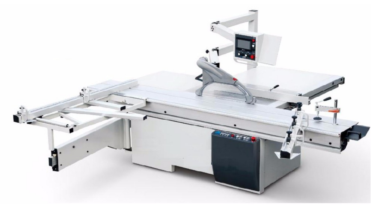
TS-P3200PL 10' Sliding Table Panel Saw (Program Position)