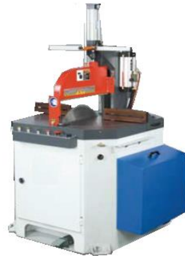
Optional: Infeed, Outfeed Rollers Table