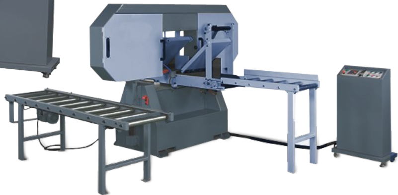
BS-1616HR 16" Hor. Band Rip Saw