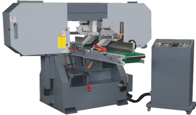
BS-1212HR 12" Hor. Band Rip Saw