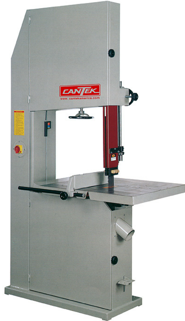
Table can be manually tilted from 0 to 45 degrees