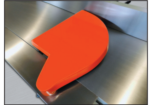
Safety Guard The spring loaded safety guard moves only when the workpiece is being fed. The guard will return to its original position upon completion of the cut ensuring a safe operation.