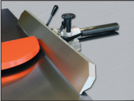
Heavy Duty Center Mounted Fence The large cast-iron fence is center mounted and adjusted in / out by rack & pinion. It can also be tilted with positive stops of 45, 90, 135° & can also be locked at any angle.