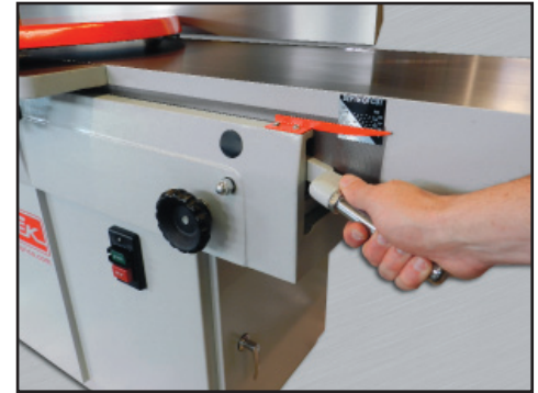
Table Raising & Lowering Mechanism The parallelogram design enables the table to travel in the same arc as the cutterhead which maintains a close & uniform distance for a safe operation regardless of the cutting depth.