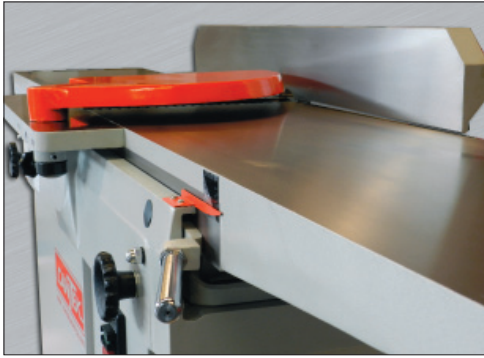
Heavy Duty Construction Solid cast iron table which is precision ground & polished for a smooth and accurate jointing surface.