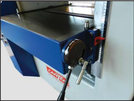
TABLE & BED ROLL ADJUSTMENT

Equipped with adjustable idle bed rollers which can be raised and lowered to facilitate in feeding difficult material. The rollers are directly opposed from the top driven feed rollers. The table surface is ground and polished to provide minimal friction.